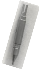
0.5mm compass pencil