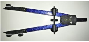
Scola-Tek quick adjust compass

The below images are for your reference, to help make sure that you purchase the correct instruments.